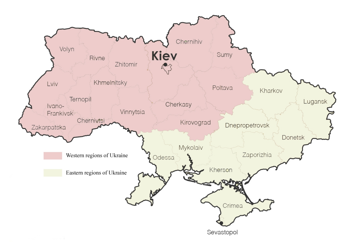
Figure 1: Division of Ukrainian oblasts into Eastern and Western regions