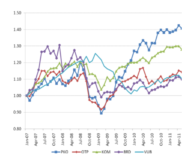
Figure 4. The dynamics of bank assets (index, 2007M1 = 1)

Figure 4 depicts the dynamics of the value volatility of the assets of the five banks as perceived from the stock market perspective.